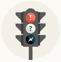
NEW SOLDIER SEX SIGNALS: MILITARY