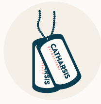
EXPERIENCED SOLDIER GOT YOUR BACK