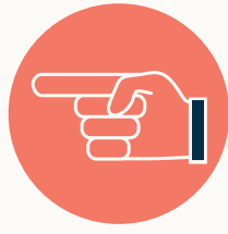
SOLDIER IN LEADERSHIP BEAT THE BLAME GAME: MILITARY