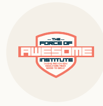
TRANSFER CAPACITY THE ARMED FORCE OF AWESOME INSTITUTE