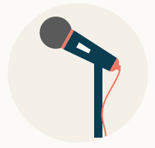
SOLDIER IN COMMAND THE CANARY IN THE COAL MINE